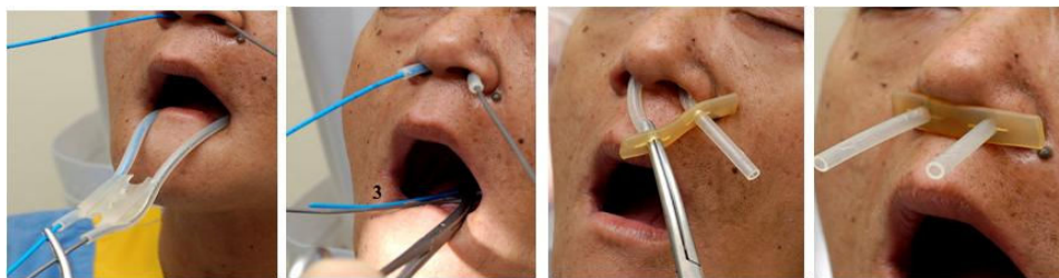
Figure 3 Volunteer with Nasopharyngeal Applicator.

the same cell line inducing phototoxicity with sulfonamide derivatives of porphycene with successful results. Betz [34] et al obtained good results in their in vitro study with amore conventional photosensitizer: 5-aminolevulinic acid.